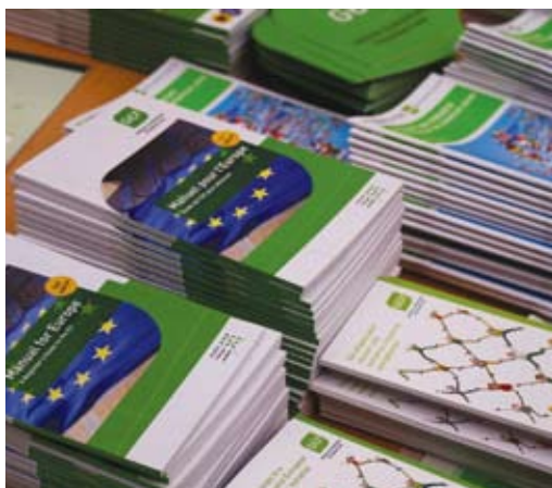
GEF publications available to participants at a GEF event