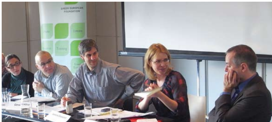
Discussing the European Citizens' Initiative and the role it can play in creating a European level political space