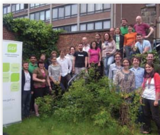
Participants in GEF's EU Seminar for Green activists