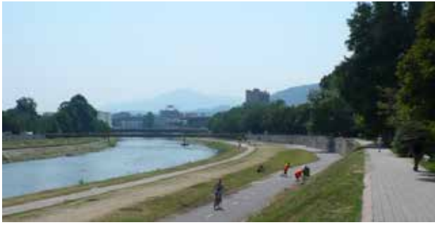
Figure 4. The existing cycle route along the Vardar riverbank connects most of the city. It is consisted of 11 kilometres downstream and 9.5 kilometres upstream cycle road accompanied with a walking path in the upper level of the river bank.