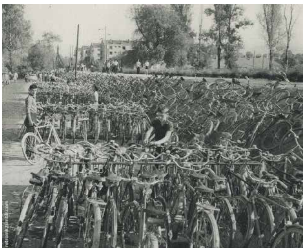
Figure 1. This photograph was taken in 1960, several years before the 1963 earthquake. At the time, Skopje was a city with a strong bicycle culture.

It was at this point that the city took on the challenge to rekindle its love affair with the bicycle, launching an ambitious transformative project entitled “Skopje Velo City” (Skopje Velograd).