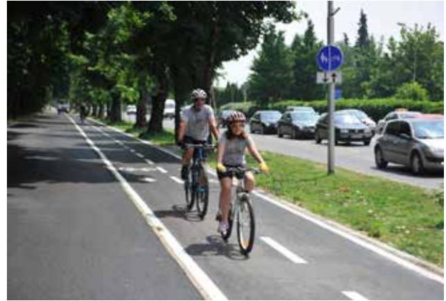
Figure 5. Reconstructed cycle and walk path with signs and signals along the busiest traffic routes in the city of Skopje

out of bicycles to sell, and the city's cycle paths are turning out to be too narrow for the number of users. A similar boom occurred around the world during the oil crisis in the 1970s. What we can learn from that boom is that people can easily go back to their old habits, and cities can become even more car-oriented than before. Skopje should seize this opportunity to improve and upgrade the Velo City project and continue with its ambitious plans beyond 2021.