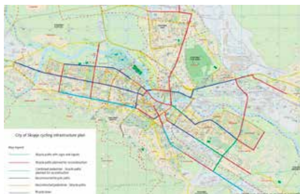
Figure 3. Map of four main bicycle routes requiring improvement (three east-west and one north-south) and seven connecting bicycle routes (all north-south).

With the help of these action plans, Skopje Velo City is making good progress towards its main goal of improving cycling in Skopje. The project has identified four main routes and seven connecting routes needing improvement (Fig. 3). Improvement works include providing appropriate road surfaces, road surface repair, constructing ramps for smooth cycling, and removing obstacles.