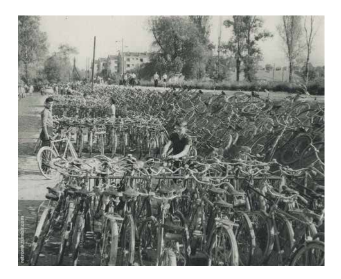
Figure 1. This photograph was taken in 1960, several years before the 1963 earthquake. At the time, Skopje was a city with a strong bicycle culture.

It was at this point that the city took on the challenge to rekindle its love affair with the bicycle, launching an ambitious transformative project entitled "Skopje Velo City" (Skopje Velograd).