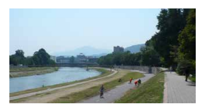
Figure 4. The existing cycle route along the Vardar riverbank connects most of the city. It is consisted of 11 kilometres downstream and 9.5 kilometres upstream cycle road accompanied with a walking path in the upper level of the river bank.