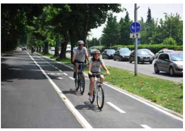
Figure 5. Reconstructed cycle and walk path with signs and signals along the busiest traffic routes in the city of Skopje

out of bicycles to sell, and the city's cycle paths are turning out to be too narrow for the number of users. A similar boom occurred around the world during the oil crisis in the 1970s. What we can learn from that boom is that people can easily go back to their old habits, and cities can become even more car-oriented than before. Skopje should seize this opportunity to improve and upgrade the Velo City project and continue with its ambitious plans beyond 2021.