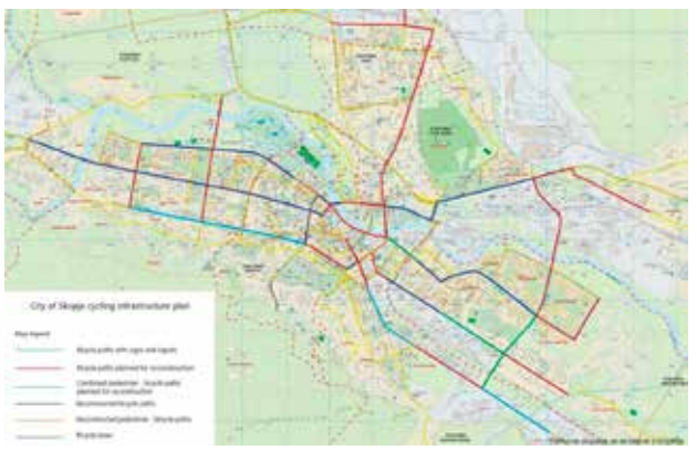
Figure 3. Map of four main bicycle routes requiring improvement (three east-west and one north-south) and seven connecting bicycle routes (all north-south).

With the help of these action plans, Skopje Velo City is making good progress towards its main goal of improving cycling in Skopje. The project has identified four main routes and seven connecting routes needing improvement (Fig. 3). Improvement works include providing appropriate road surfaces, road surface repair, constructing ramps for smooth cycling, and removing obstacles.